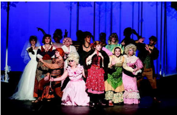
Company members in Crane River Theater's production of Into the Woods .

play series this past June with Two Rooms . Our cast, crew, directors and designers came to Kearney from Missouri, Pennsylvania, Minnesota, Indiana, New York, Texas, California, Florida, Wisconsin as well as Nebraska. Crane River Theater is truly helping to build Kearney's reputation as a destination for the arts. We want to extend a sincere thanks to everyone who enjoyed our performances, made a donation, sponsored a production or volunteered during our season. We couldn't exist without the incredible support we have received from the community and we are privileged to be located in Kearney.